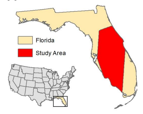
Fig. 1. Florida, U.S. – Study area (highlighted in red) for SAR citrus assessment.

complete layer, including all polygons, was used for validation of the classifications in this study. The citrus field polygon data are the most accurate, current and comprehensive delineation of the Florida citrus crop available [9].