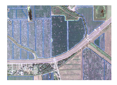
Fig. 2. Zoom of citrus field polygon data used for training and validation. All polygons are manually delineated and attributed, based on annual field inspections, in the USDA NASS Florida Field Office. Blue boundaries outline the citrus groves which are overlaid on aerial imagery.

The USGS NLCD, 2011 was the source for training of all other categories of land cover [10]. The NLCD land cover data set has a 16-class land cover category classification scheme that is applied consistently across the United States at a 30 meter spatial resolution. NLCD 2011 is based primarily on a decision-tree classification of circa 2011 Landsat satellite data.