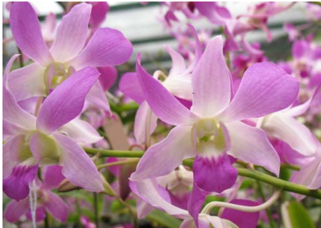
DENDROBIUMS: Value of Sales, State of Hawaii, 1998-2007 1