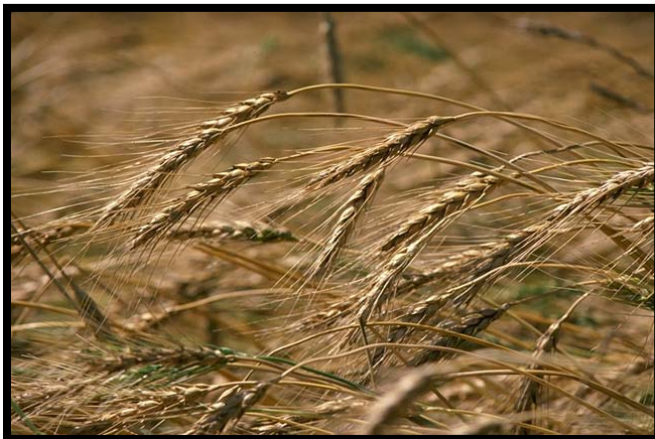
Winter Wheat Varieties Percent of Acreage Planted North Dakota, 2006 1

1 Preliminary 2006 marketing year average (MYA) price is based on entire month price data through December 2006. Final 2006 MYA price will be published in August 2007. 2 Value is computed by multiplying price by production.