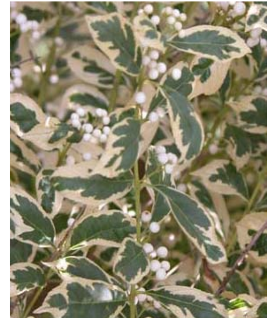
Callicarpa dichotoma 'Duet'

USDA, National Agricultural Statistics Service Tennessee Field Office