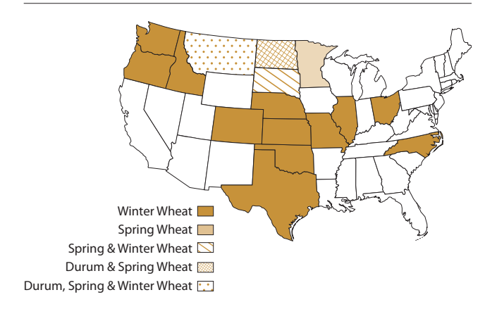
Fig. 1. States in the 2015 Wheat Chemical Use Survey

Data are for the 2015 crop year, the one-year period beginning after the 2014 harvest and ending after the 2015 harvest. "Spring wheat" does not include durum.