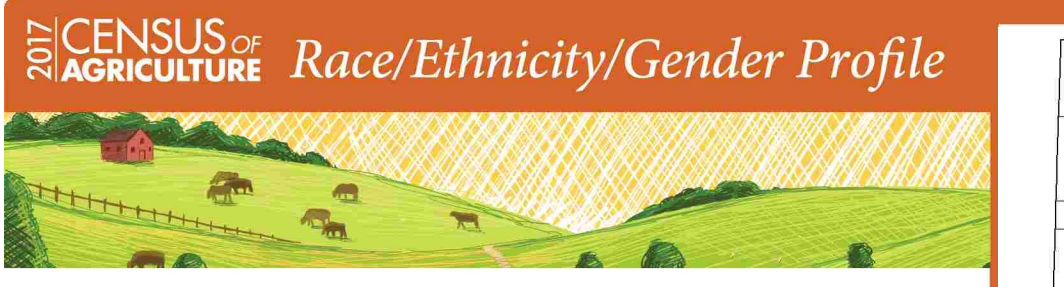
Sanpete County, Utah Farms with White Producers<sup>a</sup>