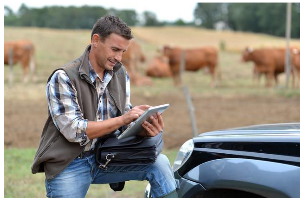
Today's farmer depends on quality data to grow. NASS knows many ag producers conduct business on the go. The fast, secure, online questionnaire will meet producers wherever they are located.

This blog was <u>originally</u> <u>posted</u> on the USDA website under Media.