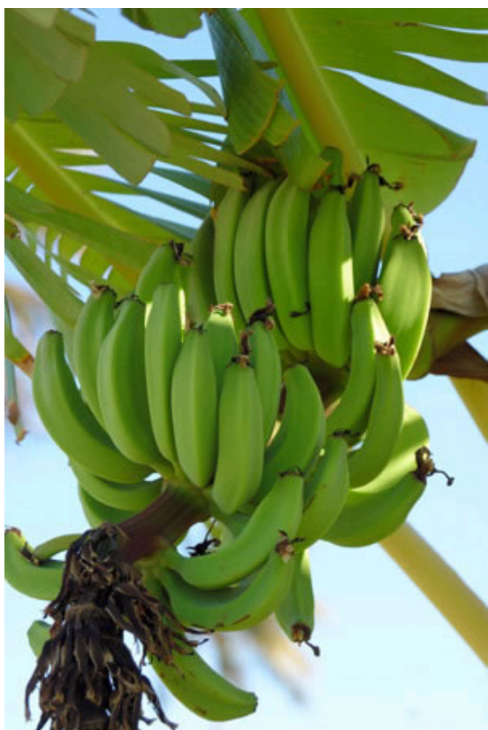
BANANAS: U.S. Fresh Banana Imports, Quantity and Value, by Country, 2009 1 Harmonized Number: 0803002020