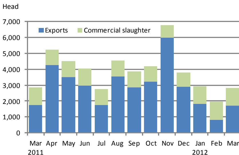
CATTLE: Monthly Commercial Production, State of Hawaii, 2011 and 2012

Cattle marketings (sum of exports and local slaughter) totaled 4,100 head for March 2012, up 8 and 46 percent compared to January and February, respectively. Exports accounted for 76 percent of March's total marketings with steers making up 55 percent of the exported cattle. Local slaughter totaled 1,000 in March 2012, down 9 percent compared to February and the same as January 2012. ■