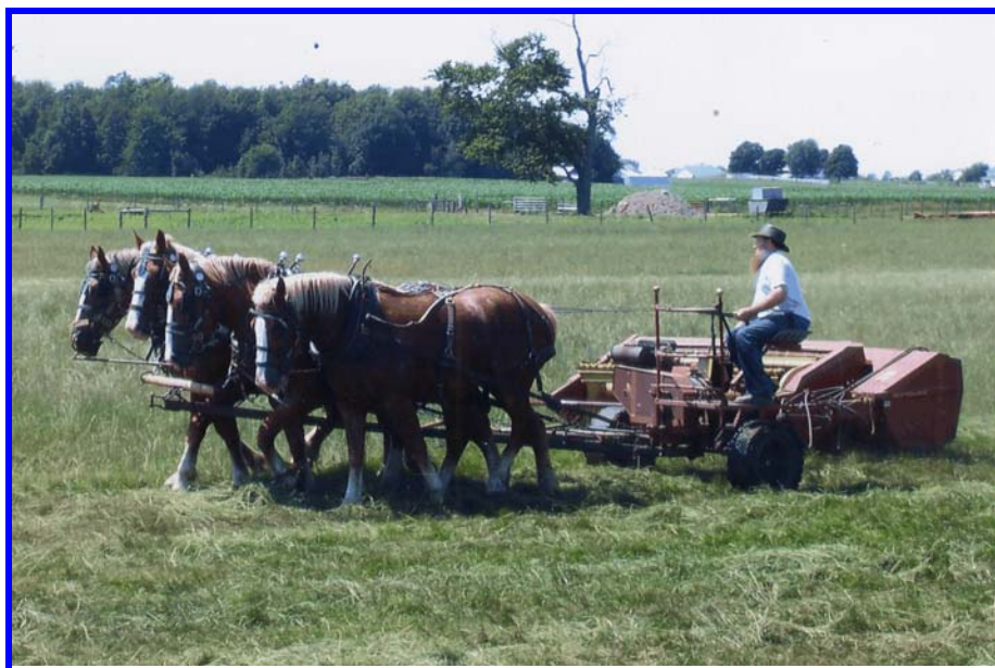
"Amish Farmer"