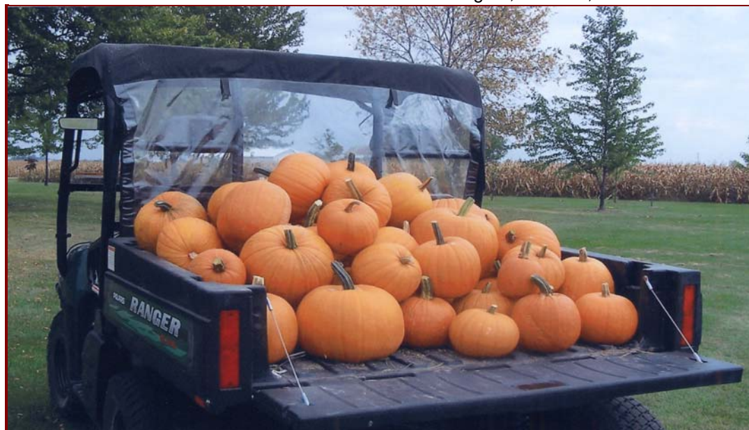
"Pumpkin Harvest" Photographer ~~ Jamie Harshman Age 9, Bluffton, IN