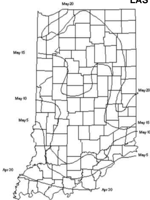
10% Probability for Frost (32°F) After the Date