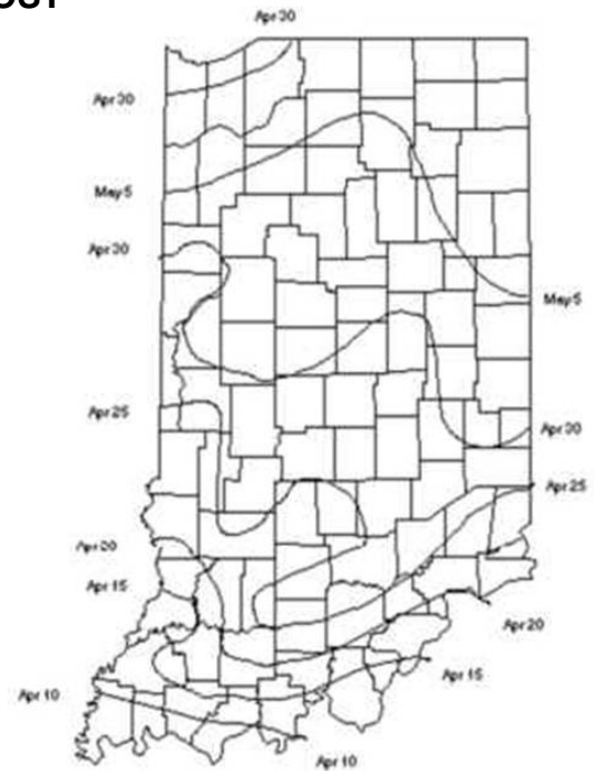
50% Probability for Frost (32°F) After the Date