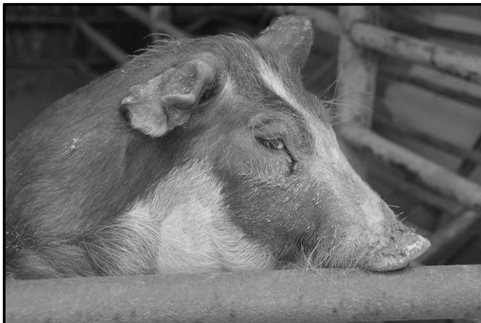
“Pig Deep in Thought” Photographer ~~ Lacy Schillmiller Age 10, Floyd Knobs, IN