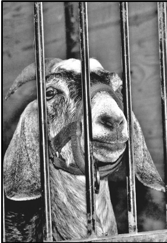
"Whatcha Doin' Out There?" Photographer ~~ Graham Melloh Age 11, Russiaville, IN

1 Includes both feeders and breeding stock.