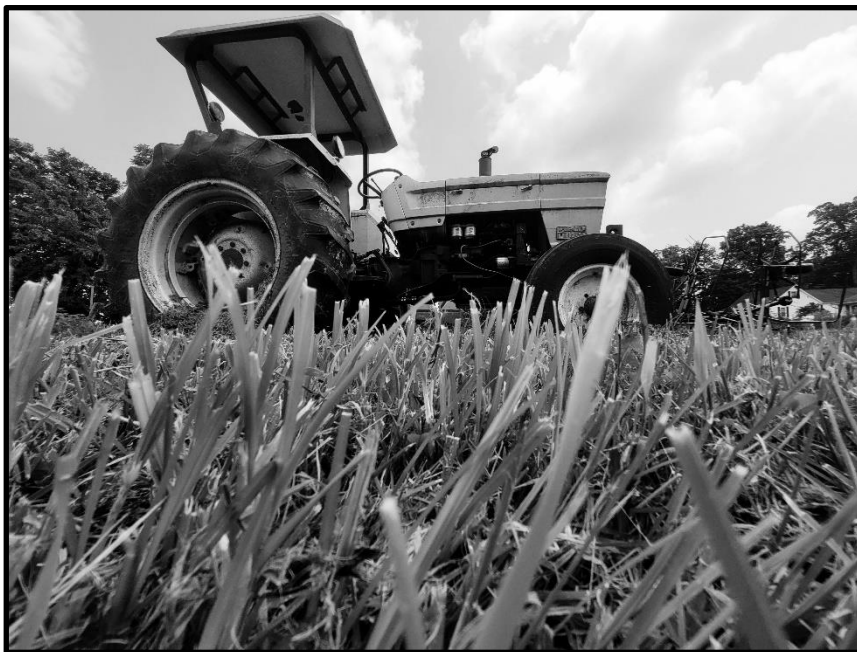
"The Old White" Photographer -- Pailyn Blair Age 12, Mooresville, IN