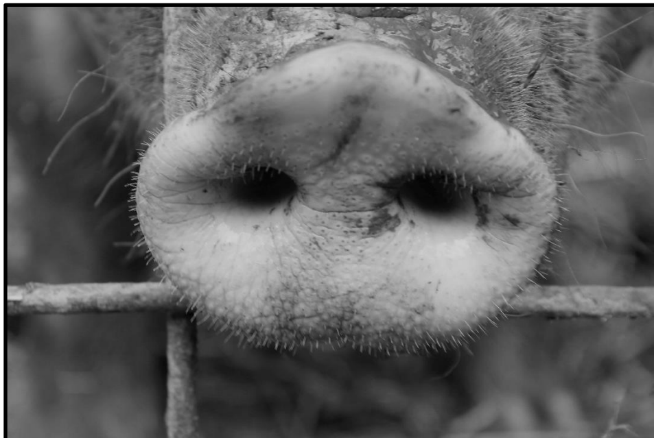
“A Pig’s Curiosity”