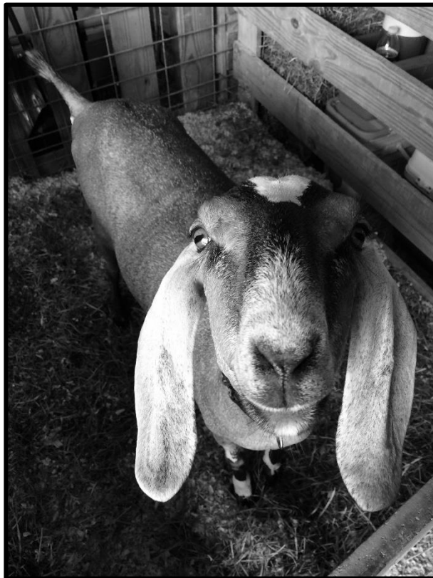
"All the Eyes on Me"

1 Includes both feeders and breeding stock.