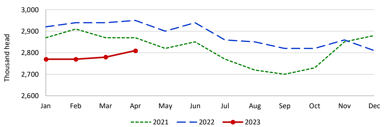
Texas Cattle and Calves on Feed in 1.000+ Capacity Feedlots, by District