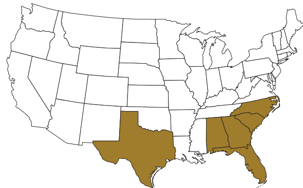
Fig. 1. States in the 2018 Peanut Chemical Use Survey

Data are for the 2018 crop year, the one-year period beginning after the 2017 harvest and ending after the 2018 harvest.