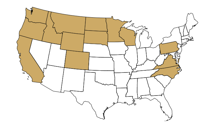
Fig. 1. States in the 2023 Barley Chemical Use Survey

The data are for the 2023 crop year, the one-year period beginning after the 2022 harvest and ending with the 2023 harvest.